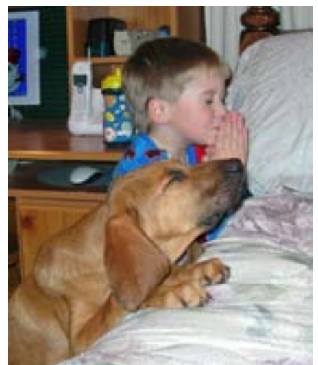
Pray Without Ceasing

God's faithful workers around the world.