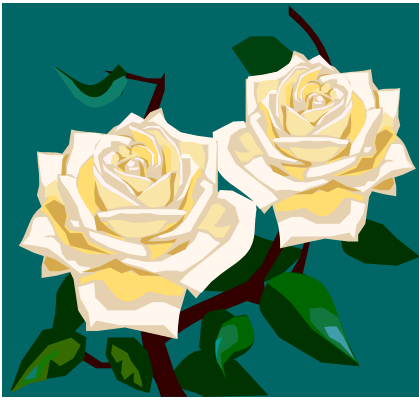
(Steps to Christ pg. 79 -

God loves you with an everlasting and unconditional love. Draw nigh to Him, and He will draw nigh to you. Maranatha