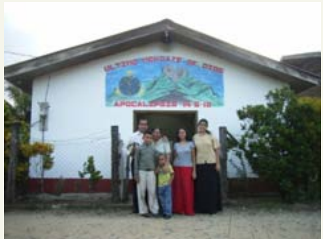
The Jimenez family.; A powerful witness in the country of Honduras.