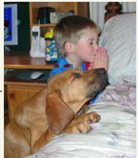
Pray Without Ceasing

Remember, God loves you with an everlasting and unconditional love. He will never leave you or forsake you.