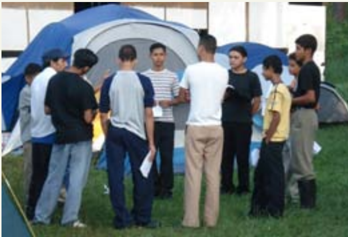
(Our young people sharing devotional thoughts)