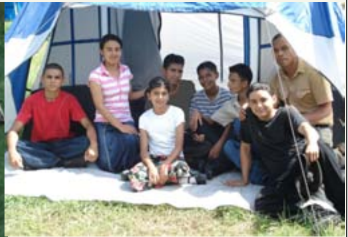
(And of course, break time is always refreshing)

For the second year, our youth from La Zona have attended the Youth Bible Camp in the town of Pinalejo. At first, our M.I.C.E. were a little shy and hesitant about participating in the camp activities; But not this year. Our young people are front and center of all the camp projects.